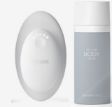
AGELOC WELLSPA iO - REVITALISE ROUTINE (DEVICE + AGELOC BODY SERUM)