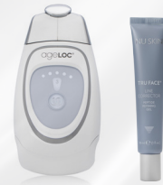
ageLOC GALVANIC FACIAL SPA WITH TRU FACE LINE CORRECTOR