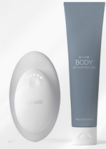
AGELOC WELLSPA iO - RESTORE ROUTINE (DEVICE + AGELOC BODY ACTIVATING GEL)