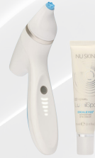
AGELOC LUMISPA iO ACCENT (Device with ageLOC LumiSpa IdealEyes)