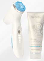
AGELOC LUMISPA iO SYSTEM (Device with ageLOC LumiSpa Activating Cleansers)