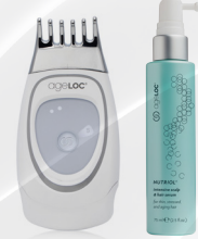
ageLOC GALVANIC FACIAL SPA WITH ageLOC NUTRIOL INTENSIVE SCALP & HAIR SERUM