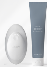
AGELOC WELLSPA iO - RESTORE ROUTINE (DEVICE + AGELOC BODY ACTIVATING GEL)