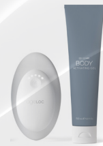
AGELOC WELLSPA iO - RELAX ROUTINE (DEVICE + AGELOC BODY ACTIVATING GEL)