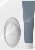
AGELOC WELLSPA iO - RELAX ROUTINE (DEVICE + AGELOC BODY ACTIVATING GEL)