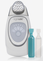
ageLOC GALVANIC FACIAL SPA SYSTEM (Device with ageLOC Facial Gels)