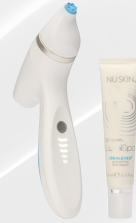
AGELOC LUMISPA iO ACCENT (Device with ageLOC LumiSpa IdealEyes)