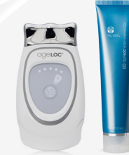
ageLOC GALVANIC FACIAL SPA WITH ageLOC BODY SHAPING GEL