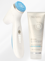
AGELOC LUMISPA iO SYSTEM (Device with ageLOC LumiSpa Activating Cleansers)